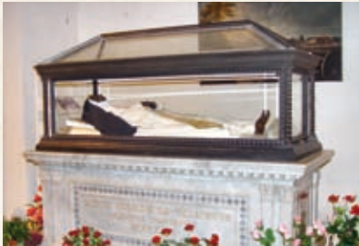
Chasse de sainte Roseline

tourists leave our area without having visited this exceptionally beautiful, old village; a jewel of medieval architecture where Saint Roseline spent her childhood and where the miracle of the roses took place.