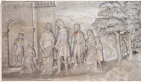
Miracle des Roses, chapelle saint Jean Baptiste