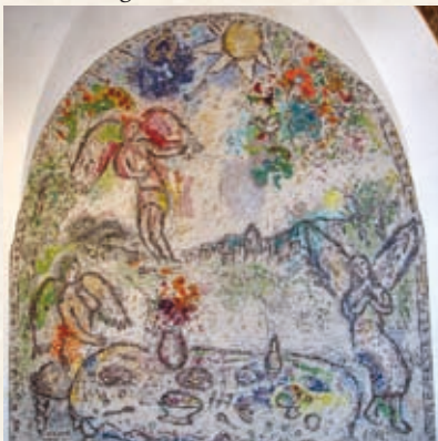
Mosaïque "Le Repas des Anges" Marc Chagall

The old village of The Parage possesses a rare charm while the Les Arcs History Museum adds an extra, emotionally-charged dimension to this remarkable place.